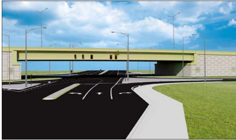
SPECIAL TO THE DAILY NEWS

Temporary lane closures will occur during utility relocation, said Tanya Branton, a spokesperson for the DOT. Officials will provide