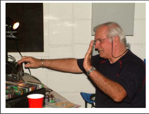
THE FRIDAY NIGHT FIRST FIXED-WING GUNSHIP REUNION MIXER