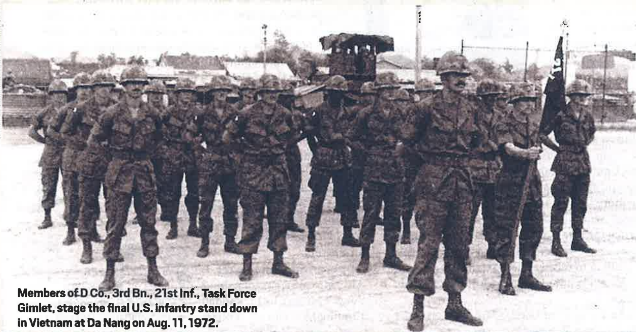
Members of D Co., 3rd Bn., 21st Inf., Task Force Gimlet, stage the final U.S. infantry stand down in Vietnam at Da Nang on Aug. 11, 1972.