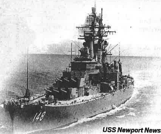
USS Newport News