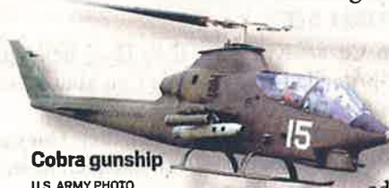
Cobra gunship

Other KIA include 2 Cobra pilots from F Btry., 79th ARA (on April 5) and 2 advisers of AT-70.