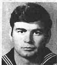
Petty Officer Michael E. Thornton