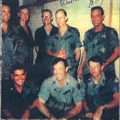
Advisory Team 70 members just five hours after returning from the Battle of An Loc where they turned back a massive NVA attack.

75. A total of 4 U.S. advisers of AT-51 are KIA fighting along Highway 13. 9,023 U.S. tactical air strikes are conducted by Air Force, Navy and Marine fighter-bombers. B-52s carry out 252 missions. AH-1G Cobra helicopter gunships and AC-130 Spectre gunships are constantly engaged. Presidential Unit Citation —Advisory Team 70 (about a dozen men) plays a pivotal role in turning back 36,000 NVA troops while outnumbered 5:1 amidst the war's heaviest and most sustained artillery and tank assaults.