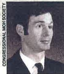
CONGRESSIONAL MOH SOCIETY

2-16: Rescue of Bat 21. In the war's greatest single rescue effort, 13 Americans are KIA (including original crash victims). 5 airmen of the 42nd TEWS are KIA when their electronic countermeasures aircraft EB-66C ( Bat 21 ) airplane is shot down by a SAM near Cam Lo. That same day, a Huey UH-1H